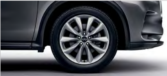
19 X 7.5-INCH SILVER-PAINTED ALUMINUM-ALLOY WHEELS