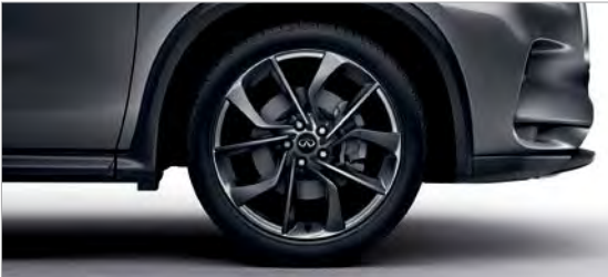
20 X 8.5-INCH DARK-PAINTED ALUMINUM-ALLOY WHEELS*