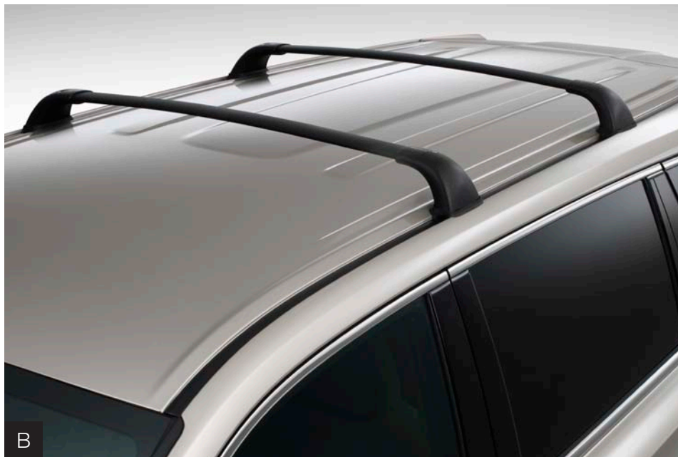
B LE models

See footnote 2 in disclosure section on back cover.