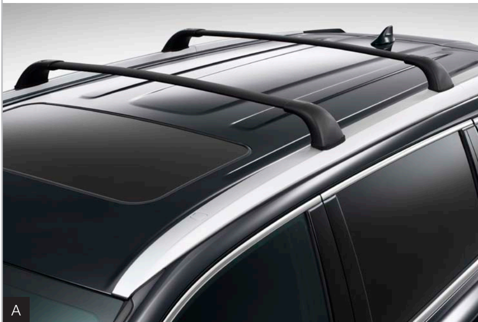
A XLE/Limited models