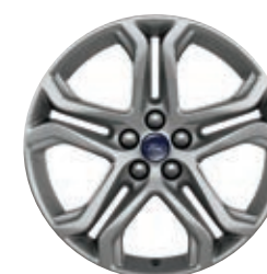
19" Luster Nickel-Painted Aluminum Standard