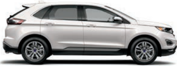
White Platinum Tri-coat Metallic