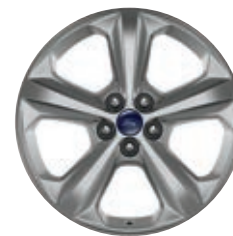
18" Sparkle Silver-Painted Aluminum Standard: SE

Utility Package includes foot-activated hands-free power liftgate; perimeter alarm; and universal garage door opener (requires 201A)