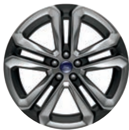
20" Polished Aluminum with Low-Gloss Magnetic-Painted Pockets Standard