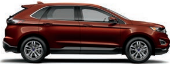
Bronze Fire Tinted Clearcoat Metallic