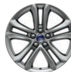
18" Polished Aluminum Available (requires snow chain-compatible tires)