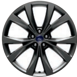
21" Premium Tarnished Dark-Painted Aluminum Available