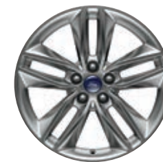
18" Sparkle Silver-Painted Split-Spoke Aluminum Standard: SEL