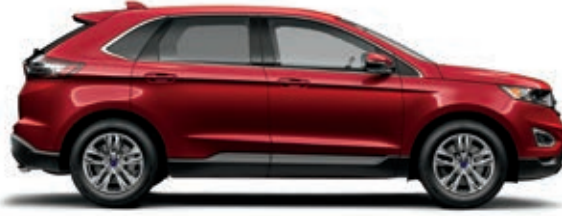
Ruby Red Tinted Clearcoat Metallic