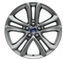
18" Polished Aluminum Available: SEL