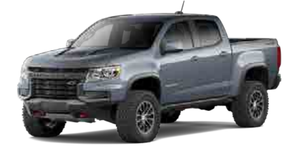
Satin Steel Metallic