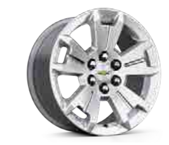
17" Blade Silver Metallic-Painted Aluminum Wheels Standard on LT