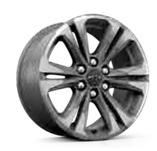
17" Bright Machined-Aluminum Wheels Standard on Z71