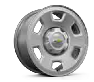
17" Ultra Silver Metallic-Painted Steel Wheels Standard on WT