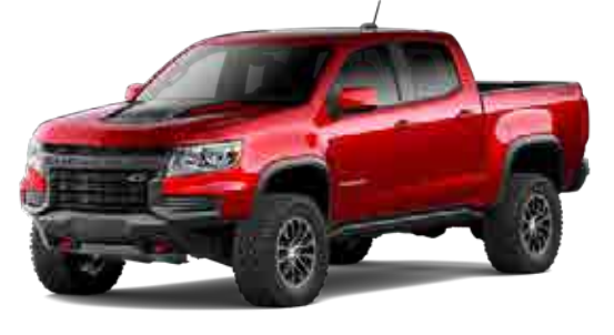
Cherry Red Tintcoat<sup>2</sup>