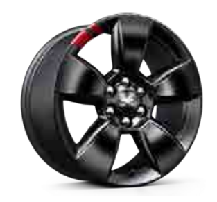
18" Black-Painted Aluminum Wheels with Red Accents Available on LT with Redline Edition