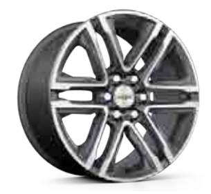
18" Dark Argent Metallic-Painted Aluminum Wheels Available on WT with Custom Special Edition