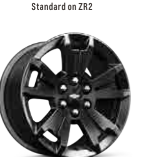
17" Gloss Black-Painted Aluminum Wheels Available on ZR2 with ZR2 Dusk Special Edition or ZR2 Midnight Special Edition