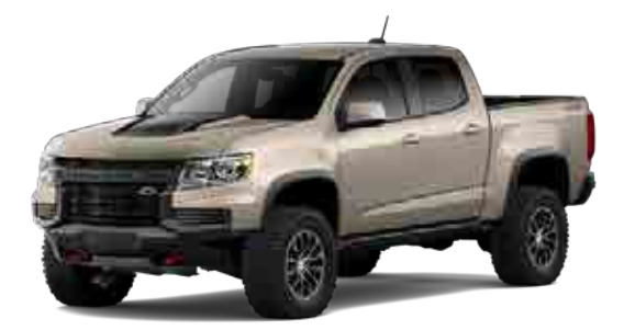
Sand Dune Metallic<sup>1</sup>