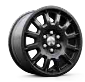
17" AEV-Designed Dark Graphite Aluminum Wheels Available on ZR2 with ZR2 Bison Edition

ZR2 In addition to or replacing Z71 features, ZR2 includes: