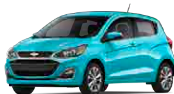
Mystic Blue 1