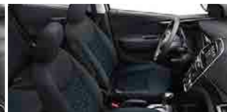
Jet Black Cloth with Dark Anderson Silver Accent Trim 4