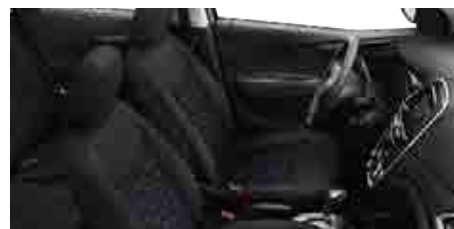
Jet Black Cloth 3