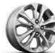
15" Silver-Painted Aluminum (1LT and 2LT)