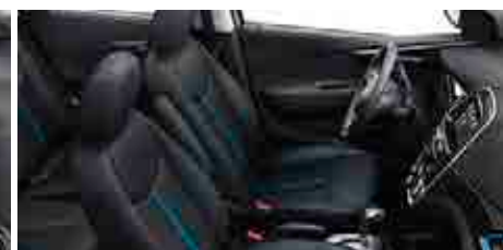
Jet Black Leatherette with Caribbean Blue Accent Stripe and Accent Trim 6