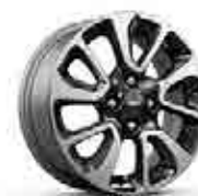
15" Gunmetal Silver-Painted Aluminum (ACTIV)