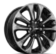
15" Black-Painted Machined-Finish Aluminum (Available on 1LT)