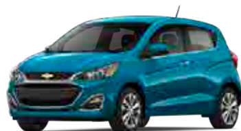
Caribbean Blue 1,2