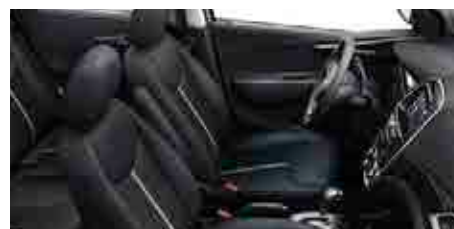
Jet Black Leatherette with Dark Anderson Silver Accent Stripe and Accent Trim 5