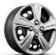
15" Steel with Bolt-On Wheel Cover (LS)