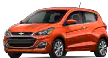
Cayenne Orange 1