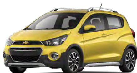
Nitro Yellow 1