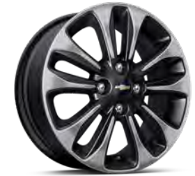
15" Black-Painted Machined-Finish Aluminum Wheels Available on 1LT with Spark Special Edition