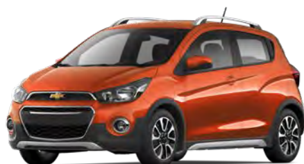
Cayenne Orange 1