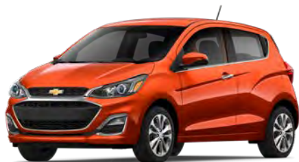
Cayenne Orange 1