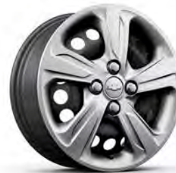
15" Steel Wheels with Painted Wheel Covers Standard on LS