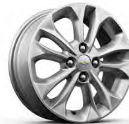
15" Silver-Painted Aluminum Wheels Standard on 1LT