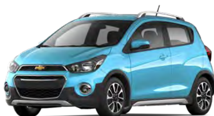
Mystic Blue 1