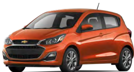
Cayenne Orange 1