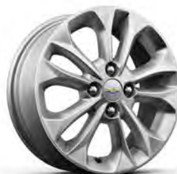
15" Silver-Painted Aluminum Wheels Standard on 2LT

1 Chevrolet Infotainment System functionality varies by model. Full functionality requires compatible Bluetooth and smartphone, and USB connectivity for some devices. 2 Safety or driver assistance features are no substitute for the driver's responsibility to operate the vehicle in a safe manner. Read the vehicle Owner's Manual for important feature limitations and information. 3 If you decide to continue service after your trial, your selected subscription plan will automatically renew thereafter. You will be charged at then-current rates. Fees and taxes apply. To cancel you must call SiriusXM at 1-866-635-2349. See SiriusXM Customer Agreement for complete terms at siriusxm.com . All fees and programming subject to change.