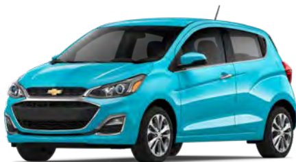
Mystic Blue 1