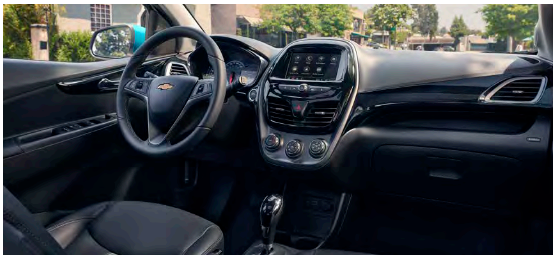
Spark 2LT interior in Jet Black.