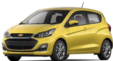
Nitro Yellow 1