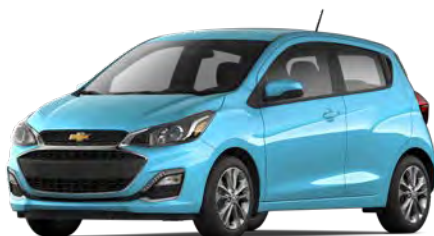
Mystic Blue 1