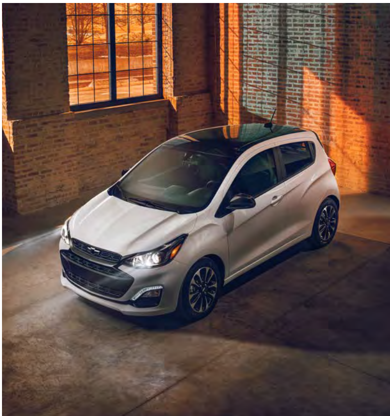
Spark Special Edition.