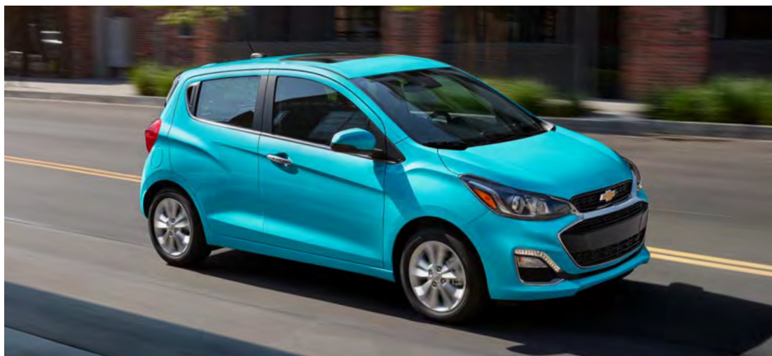
Spark 2LT in Mystic Blue (extra-cost color).

1 Chevrolet Infotainment System functionality varies by model. Full functionality requires compatible Bluetooth and smartphone, and USB connectivity for some devices. 2 Vehicle user interface is a product of Apple and its terms and privacy statements apply. Requires compatible iPhone and data plan rates apply. 3 Vehicle user interface is a product of Google, and its terms and privacy statements apply. Requires the Android Auto app on Google Play and a compatible Android smartphone. Data plan rates apply. You can check which smartphones are compatible at g.co/androidauto/requirements . 4 Service varies with conditions and location. Requires active service and paid AT&T data plan. Visit onstar.com for details and limitations. 5 Not compatible with all devices. 6 Cargo and load capacity limited by weight and distribution. 7 Safety or driver assistance features are no substitute for the driver's responsibility to operate the vehicle in a safe manner. Read the vehicle Owner's Manual for important feature limitations and information.