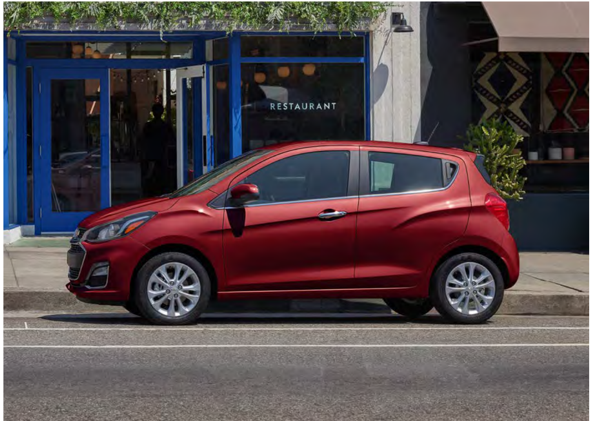
Spark 2LT in Crimson.

Going small can be the fastest way to keep up in today's world. Chevrolet Spark is not only fun to drive, but it also fits almost anywhere you want to go, with space for friends and fun. Spark offers innovative safety features and smart technologies that help keep you connected along the way. Better yet, you'll now have your pick of all those too-small-for-everybody-else parking spots.