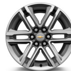
18" Dark Argent Metallic-painted aluminum (RCV) (Available on WT 6 and LT)