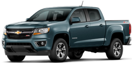
GJI – Shadow Grey Metallic 1