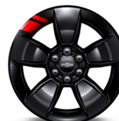
18" Black-painted aluminum with Red accents (RSZ) (Available on LT) 7