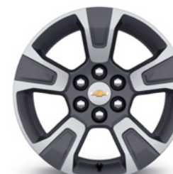
17" Dark Argent Metallic-painted aluminum (R28) (Standard on Z71)