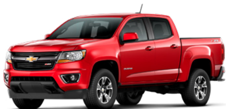
G7C – Red Hot 3