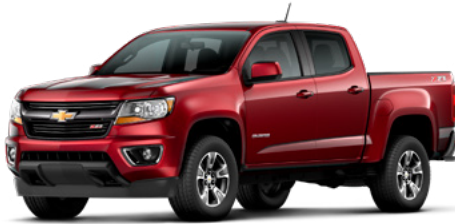
GPJ – Cajun Red Tintcoat 1,4