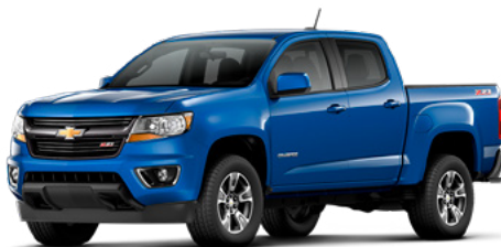
GD1 – Kinetic Blue Metallic 1