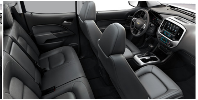
Dark Ash Leather Appointments with Jet Black Accents 5