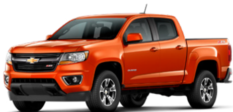
G16 – Crush 1