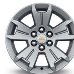
17" Blade Silver Metallic-painted aluminum (Q5U) (Standard on LT)