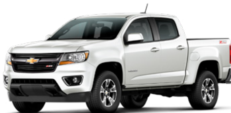
GAZ – Summit White