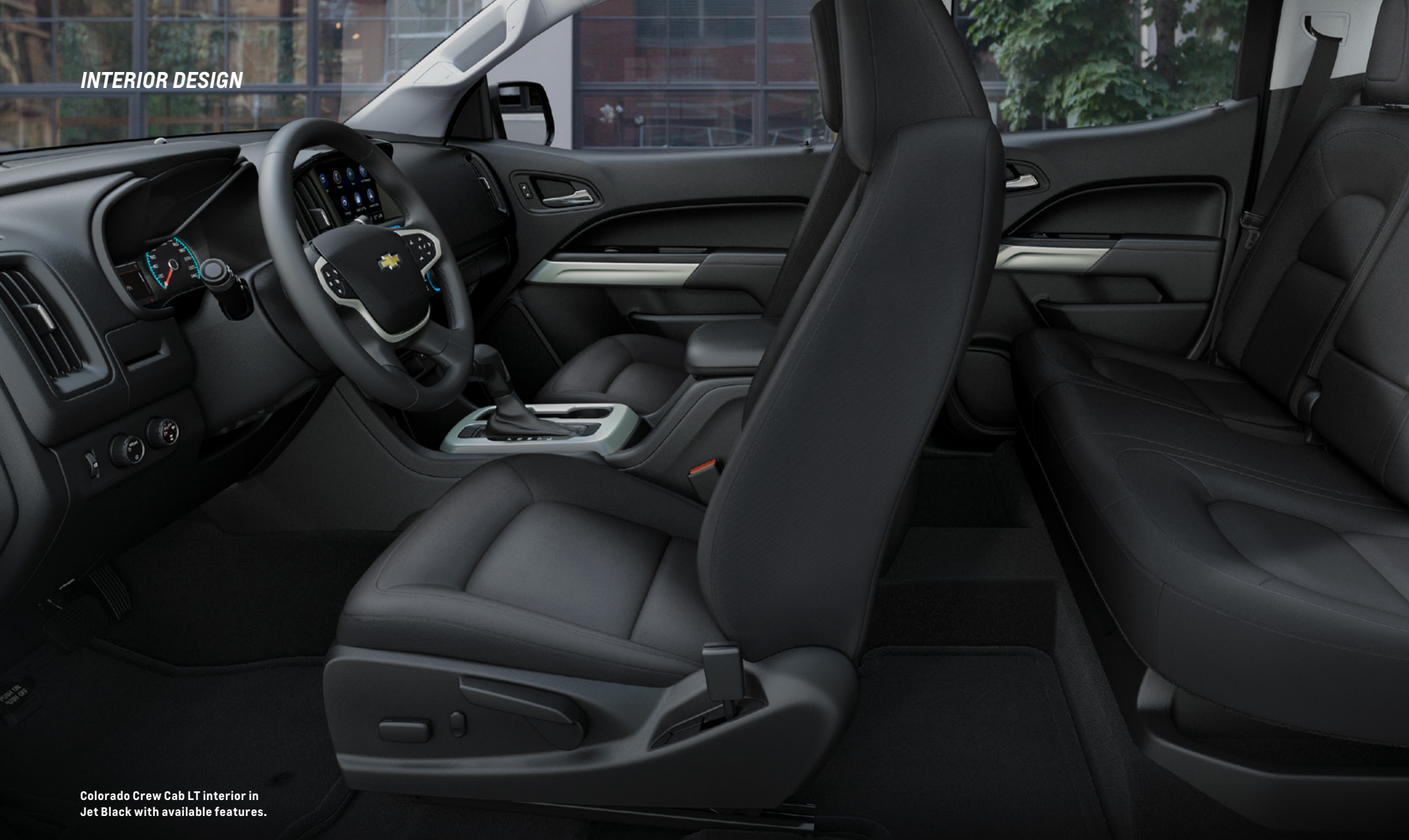
Colorado Crew Cab LT interior in Jet Black with available features.