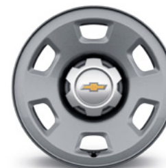
16" Ultra Silver Metallic-painted steel (RS2) (Standard on Base and WT)