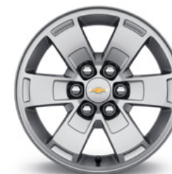
16" Ultra Silver Metallic-painted aluminum (RS1) (Available on WT) 5