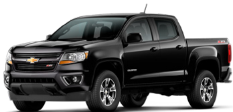
GBA – Black