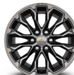
17" aluminum (R34) (Standard on ZR2)