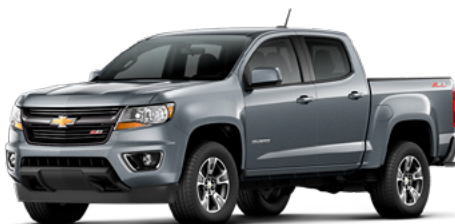
G9K – Satin Steel Metallic 1