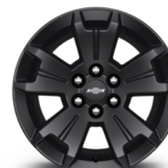
17" Gloss Black-painted aluminum (RIF) (Available on Z71 8 and ZR2 9 )