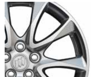
19" 10-Spoke Aluminum, Bright Machine-Faced With Midnight Silver Painted Finish Dealer-installed accessory. 5

5 Use only GM-approved tire and wheel combinations. See buick.ca/accessories.html for important tire and wheel information, or see your dealer.