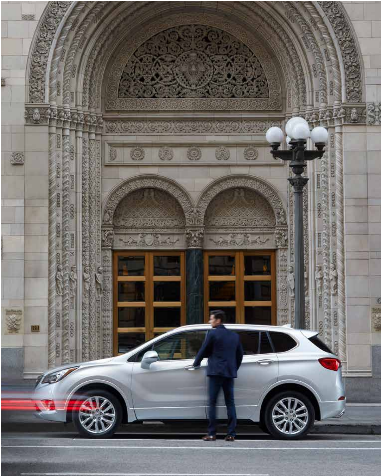
Envision Premium II shown in Galaxy Silver Metallic with available features.