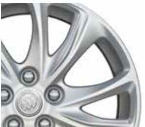
18" 10-Spoke Aluminum With Blade Silver Painted Finish Standard on Preferred.