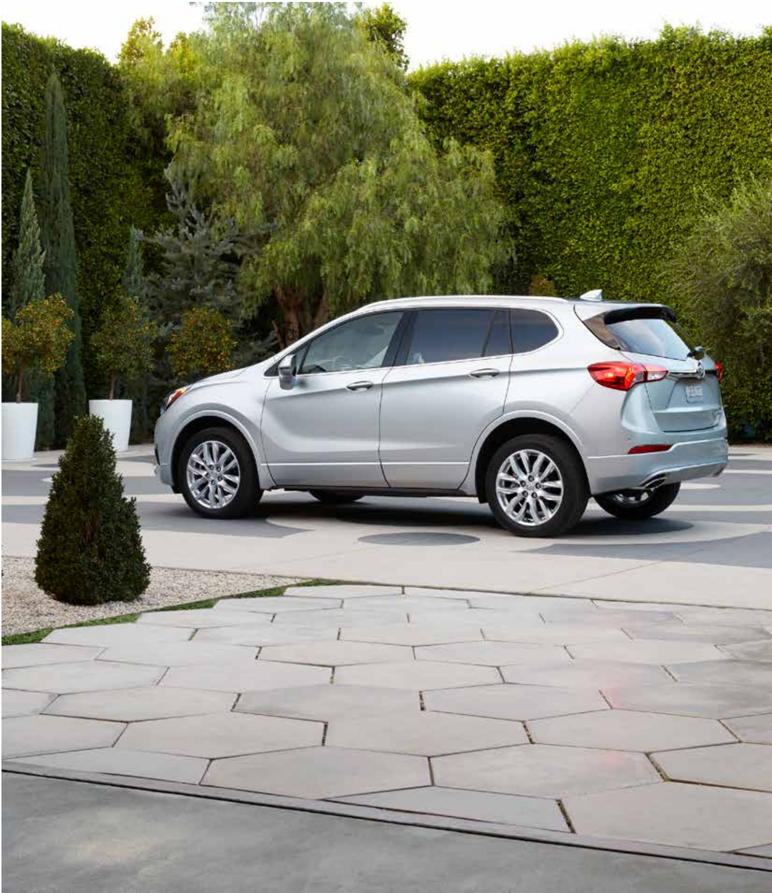
Envision Premium II shown in Galaxy Silver Metallic with available features.