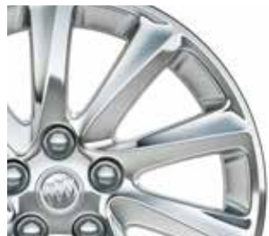
18" 10-Spoke Aluminum With Polished Finish Standard on Essence.