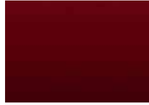
Chili Red Metallic 1