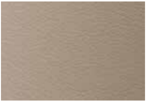
Light Neutral Cloth 2 or Perforated Leather-Appointed Seating 3