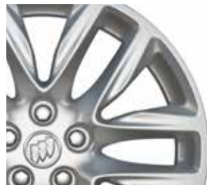
19" 12-Spoke Aluminum With Manoojian Silver Finish Standard on Premium and Premium II.