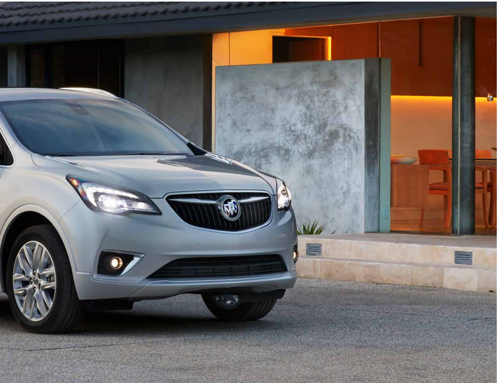
Envision Premium II shown in Galaxy Silver Metallic with available features.