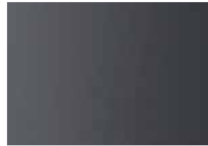
Dark Galvanized Perforated Leather-Appointed Seating 3,4

Ebony accents included with all interior colours.