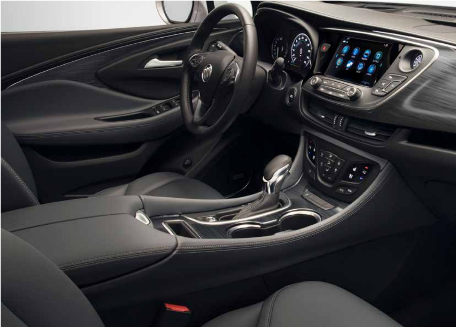
Envision Premium II interior shown in Dark Galvanized with Ebony accents and available features.