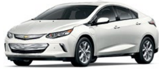
G1W – Iridescent Pearl Tricoat 1