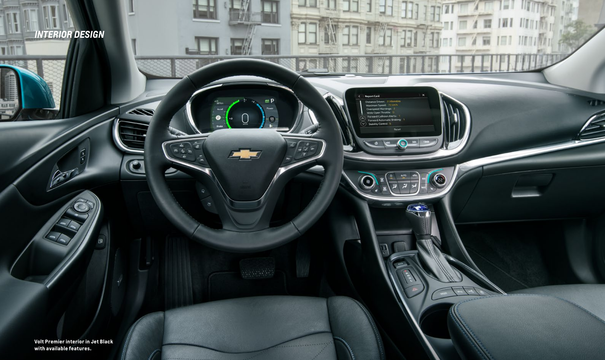
Volt Premier interior in Jet Black with available features.

A WARM WELCOME. Inside, everything about Volt is visually stunning. The beautifully crafted interior features standard heated front bucket seats that keep you comfortably in place, while twin-needle stitching provides a luxurious appeal. A refined driving experience is achieved before you even take off.