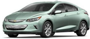
G9A – Green Mist Metallic 1