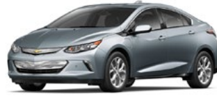
G9K – Satin Steel Metallic 1