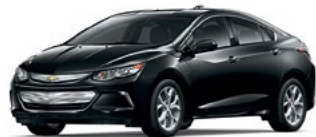
GB8 – Mosaic Black Metallic 1