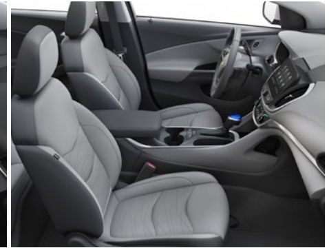
Light Ash Grey Leather-Appointed Seating with Dark Ash Grey Accents 3,4