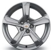
17" 5-spoke painted-aluminum (Standard on LT)