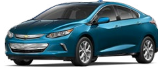
G60 – Pacific Blue Metallic 1