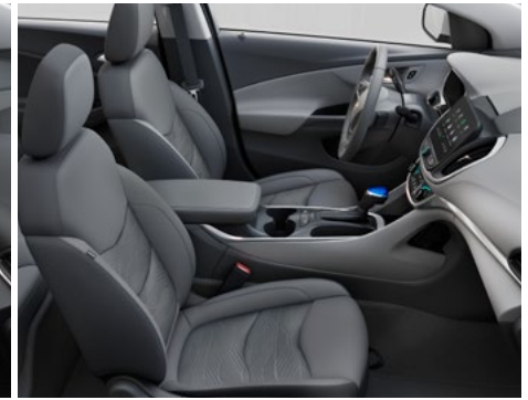
Dark Ash Grey Premium Cloth with Light Ash Grey Accents 2,3