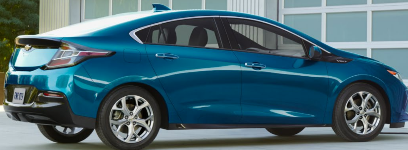
Volt Premier in Pacific Blue Metallic (extra-cost colour). Available 240-volt charging station shown (professional installation required).