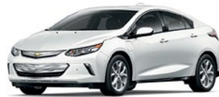
GAZ – Summit White