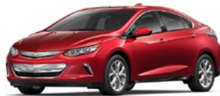
GPJ – Cajun Red Tintcoat 1