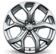
17" split 5-spoke Ultra Bright machined-finish aluminum with painted pockets (Standard on Premier)