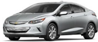
GAN – Silver Ice Metallic