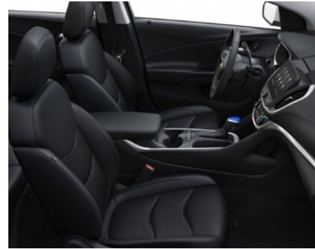
Jet Black Leather-Appointed Seating with Jet Black Accents 4,5