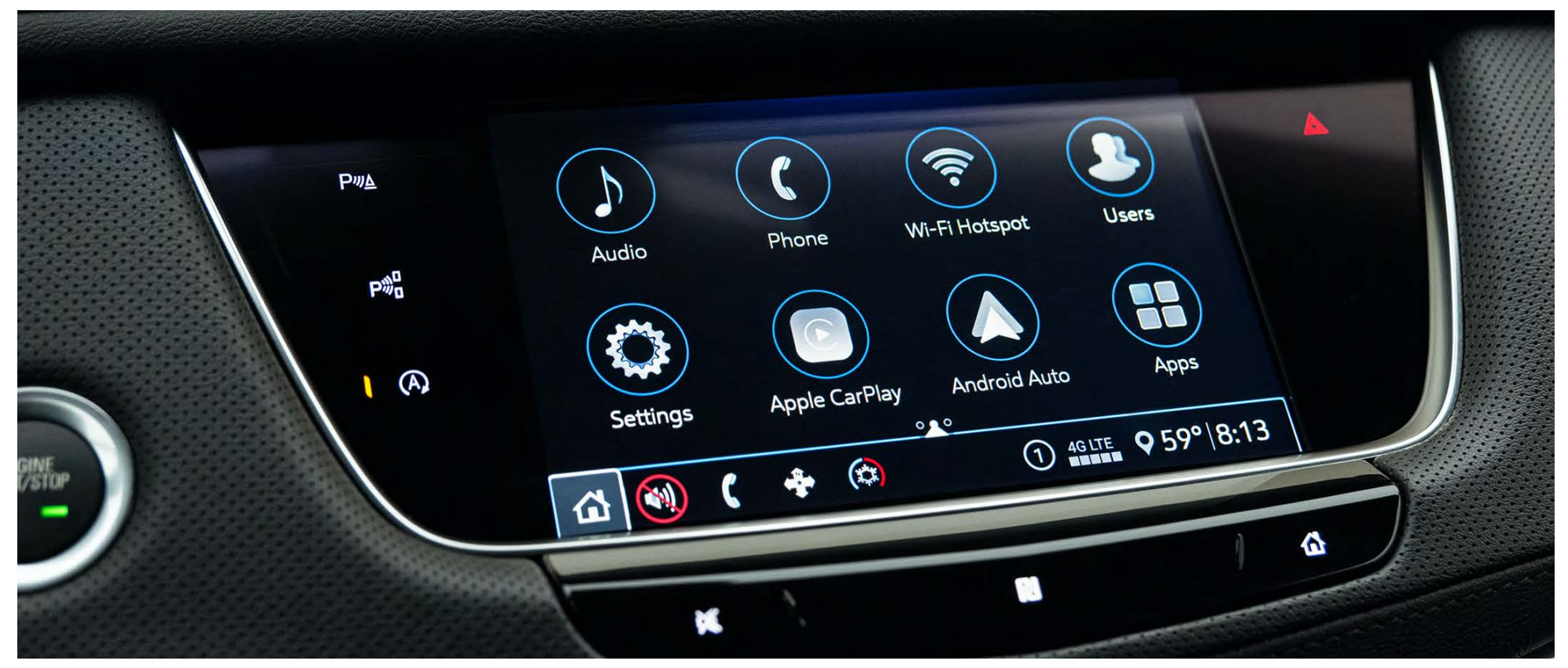
US model shown

The XT5 offers a collection of high-tech features that are both practical and indulgent. Whether it's cameras to help with safety or the need to quickly find your favourite station, you can keep your eyes on the road and stay connected wherever you are headed.