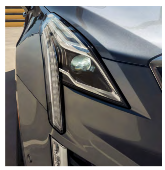
IntelliBeam can automatically turn the vehicle's high-beam headlamps on and off according to surrounding traffic conditions.

Complete with Cadillac logo projection, the available Hands-Free Power Liftgate opens and closes with a simple kicking gesture. The memory height function lets you program its opening height to ensure a perfect fit in any space.