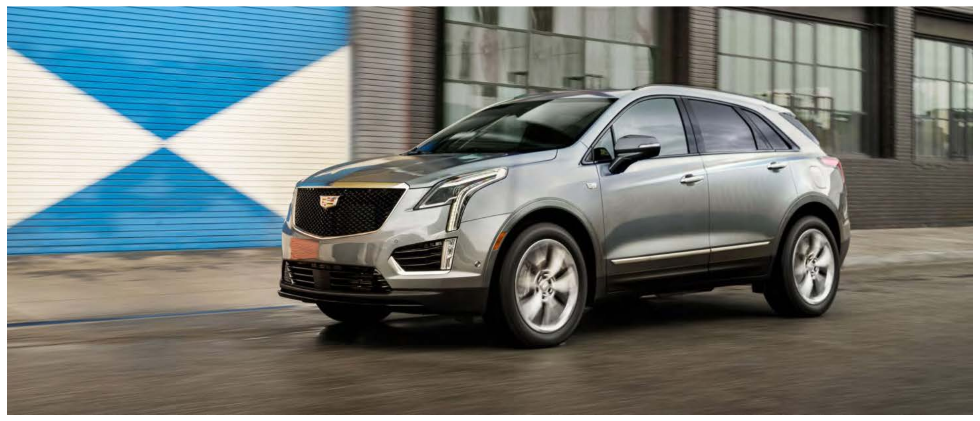
*With Premium Gasoline

The 3.6L V6 engine, available on Premium Luxury and standard on Sport trim, is designed to stand out with 310 hp [231 kW] and 271 lb-ft [366 N-m] of torque. The 2.0L engine, standard on Luxury and Premium Luxury trim, has 235 HP* [175 kW] and 258 lb-ft [350 N-m] of torque* with innovative technologies such as Active Fuel Management.