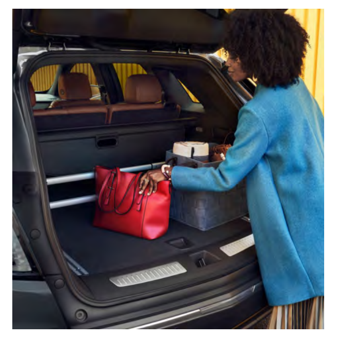
^1\mbox{With rear seats} folded down. Cargo and load capacity limited by weight and distribution.

The available UltraView® Power Sunroof spans both seating rows, providing every passenger a clear view of the sky.