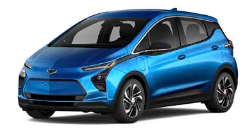
Bright Blue Metallic<sup>1</sup>