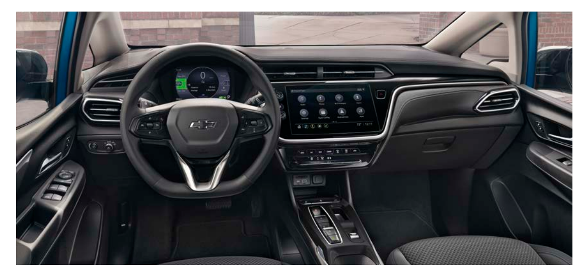
Bolt EV 1LT interior in Jet Black.

1 Cargo and load capacity limited by weight and distribution. 2 Based on initial vehicle movement. 3 Safety or driver assistance features are no substitute for the driver's responsibility to operate the vehicle in a safe manner. Read the vehicle 0wner's Manual for important feature limitations and information. 4 Vehicle user interface is a product of Apple and its terms and privacy statements apply. Requires compatible iPhone and data plan rates apply. 5 Vehicle user interface is a product of Google and its terms and privacy statements apply. To use Android Auto on your car display, you'll need an Android phone running Android 6 or higher, an active data plan, and the Android Auto app. 6 Functionality is subject to limitations and varies by vehicle, infotainment system and location. Select service plan required. Certain Alexa Skills require account linking to use. Visit onstar.com for additional details. 7 U.S. only. Requires select service plan. Functionality is subject to user terms and limitations and varies by vehicle model. Visit onstar.com for details and limitations.