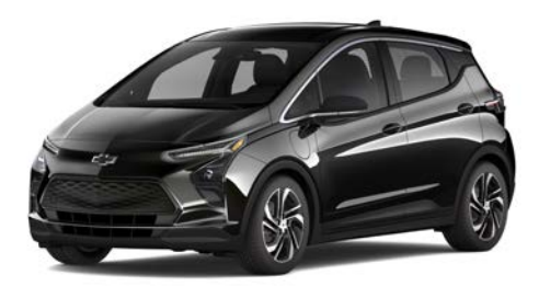
Mosaic Black Metallic