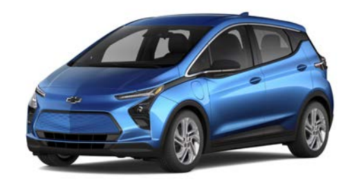
Bright Blue Metallic<sup>1</sup>