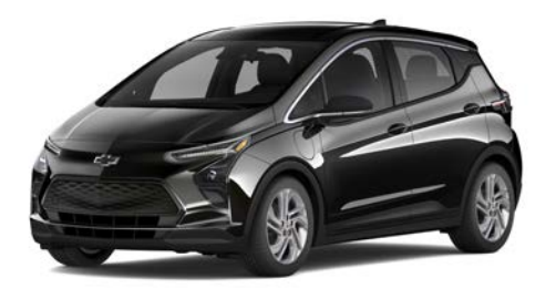
Mosaic Black Metallic