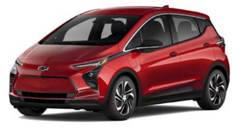
Radiant Red Tintcoat<sup>1</sup>