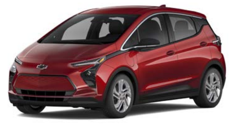
Radiant Red Tintcoat<sup>1</sup>