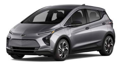
Gray Ghost Metallic