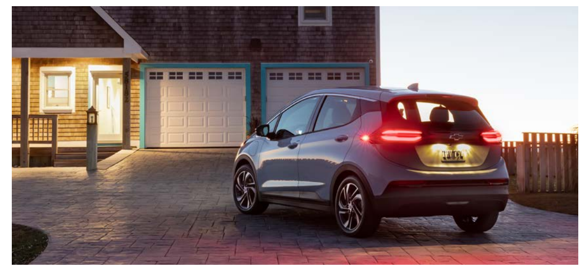
Bolt EV 2LT in Ice Blue Metallic.