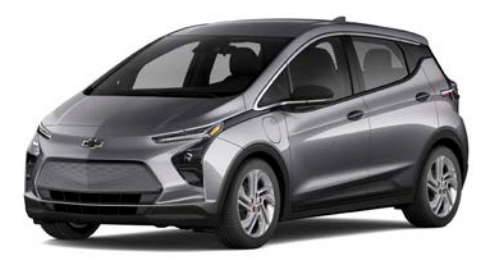
Gray Ghost Metallic