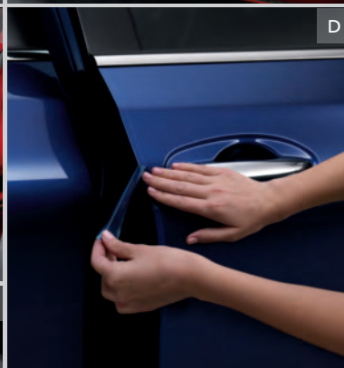
D. Clear Door Edge Protector 38 Help preserve your paint.