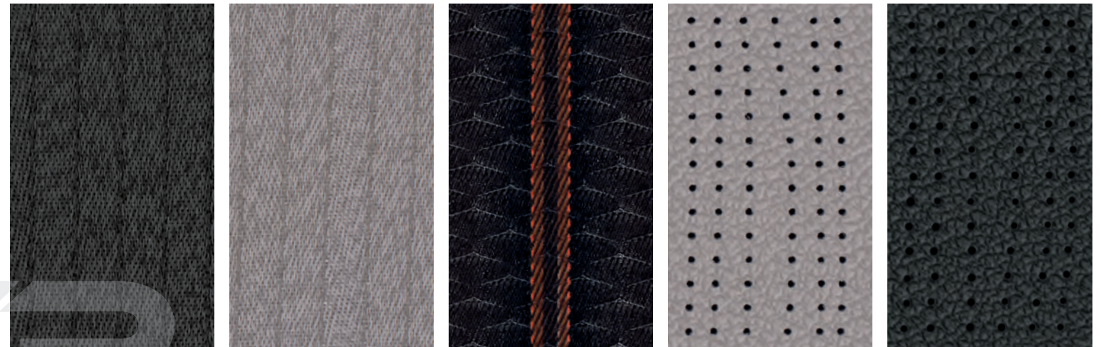
Charcoal Cloth S|SV Gray Cloth SV Charcoal Sport Cloth SR Gray Leather 19 SL|Platinum Charcoal Leather 19 SL|Platinum