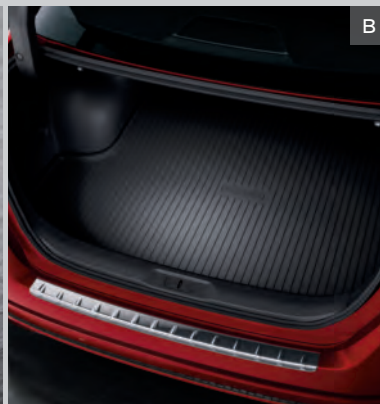
B. All-Season Trunk Area Protector Keep it looking like new.