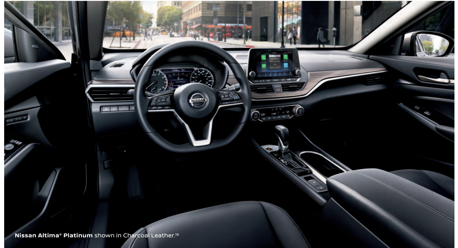
Nissan Altima ® Platinum shown in Charcoal Leather. 19