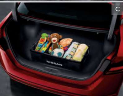
C. Portable Cargo Organizer 37 A place for everything and everything in its place.