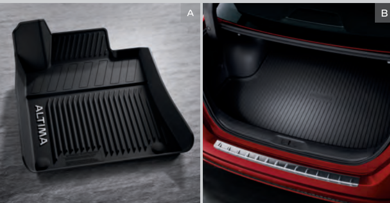
A. All-Season Floor Mats - High Wall Liners Skip the mud – and other messes.