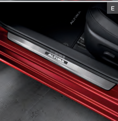
E. Illuminated Kick Plates Fewer scuffs and a grand entry, every time.