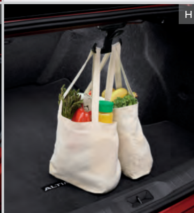
H. Shopping Bag Hooks Secure your groceries and keep it together.