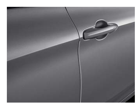
Door edge guards

This is a great way to add extra personality to your Avalon. Not every accessory is available in your area, so for a complete list of accessories, go to toyota.com/avalon/accessories.