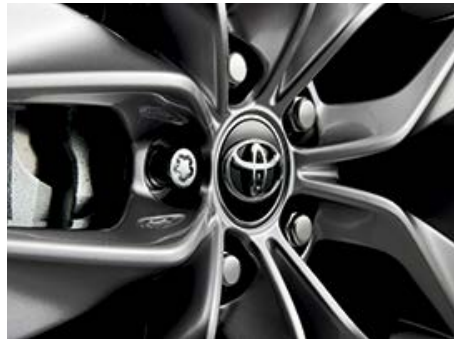
Alloy wheel locks