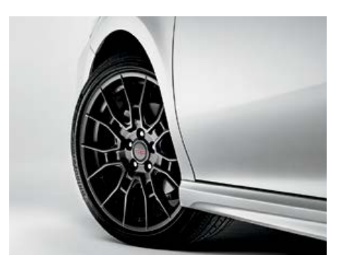
TRD 19-in. alloy wheels