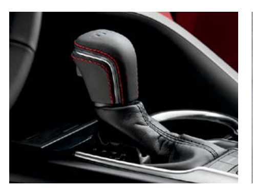
TRD shift knob