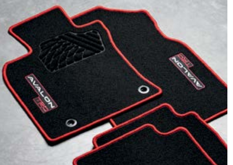
TRD carpet floor mats<sup>40</sup>