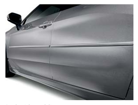
Body side moldings