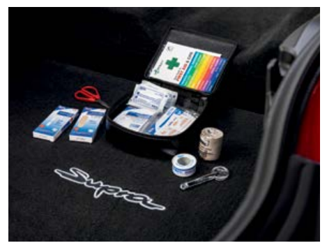
First aid kit<sup>41</sup>