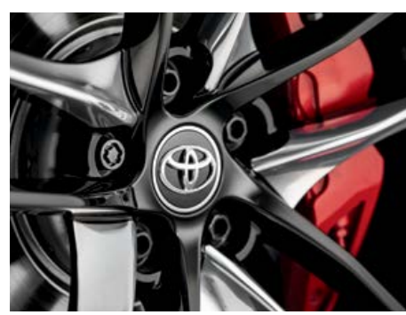
Alloy wheel locks