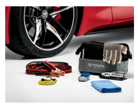
Emergency assistance kit