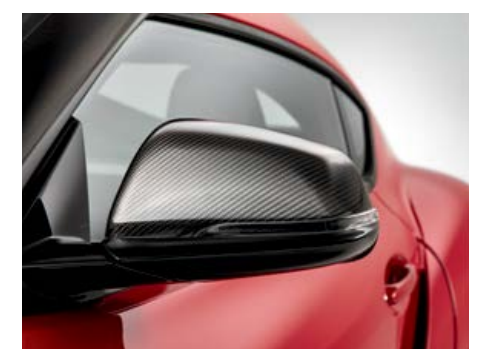
Carbon-fiber mirror caps

Add a personal touch to your GR Supra with Genuine Toyota Accessories. Some accessories may not be available in all regions of the country. See your Toyota dealer for details.