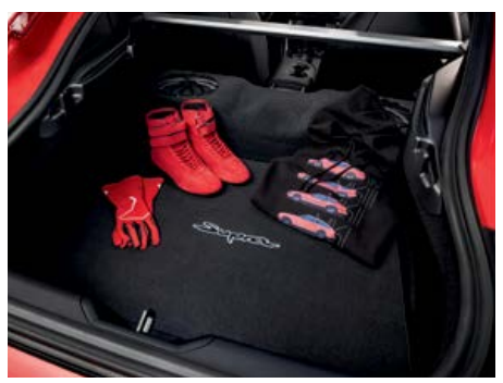
Carpet cargo mat<sup>41</sup>