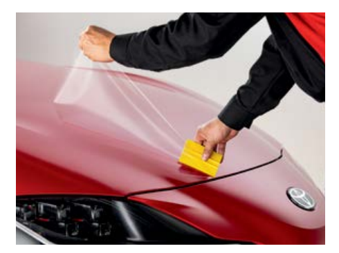
Paint protection film<sup>40</sup>