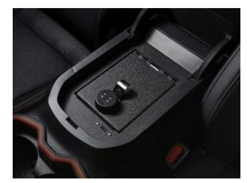
In-vehicle safe by Console Vault®

This is a great way to add extra personality to your RAV4. Not every accessory is available in your area, so for a complete list of accessories, go to toyota.com/rav4/accessories.