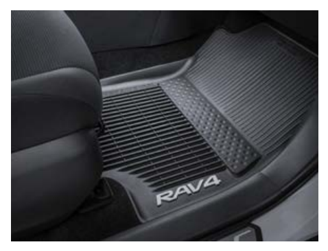
All-weather floor liners<sup>44</sup>