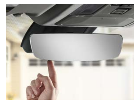
Frameless HomeLink®<sup>39</sup> mirror