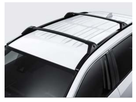
Roof rack cross bars