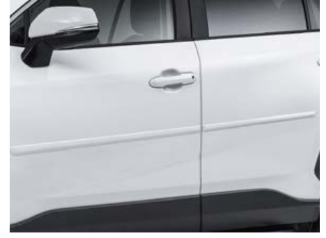
Body side moldings