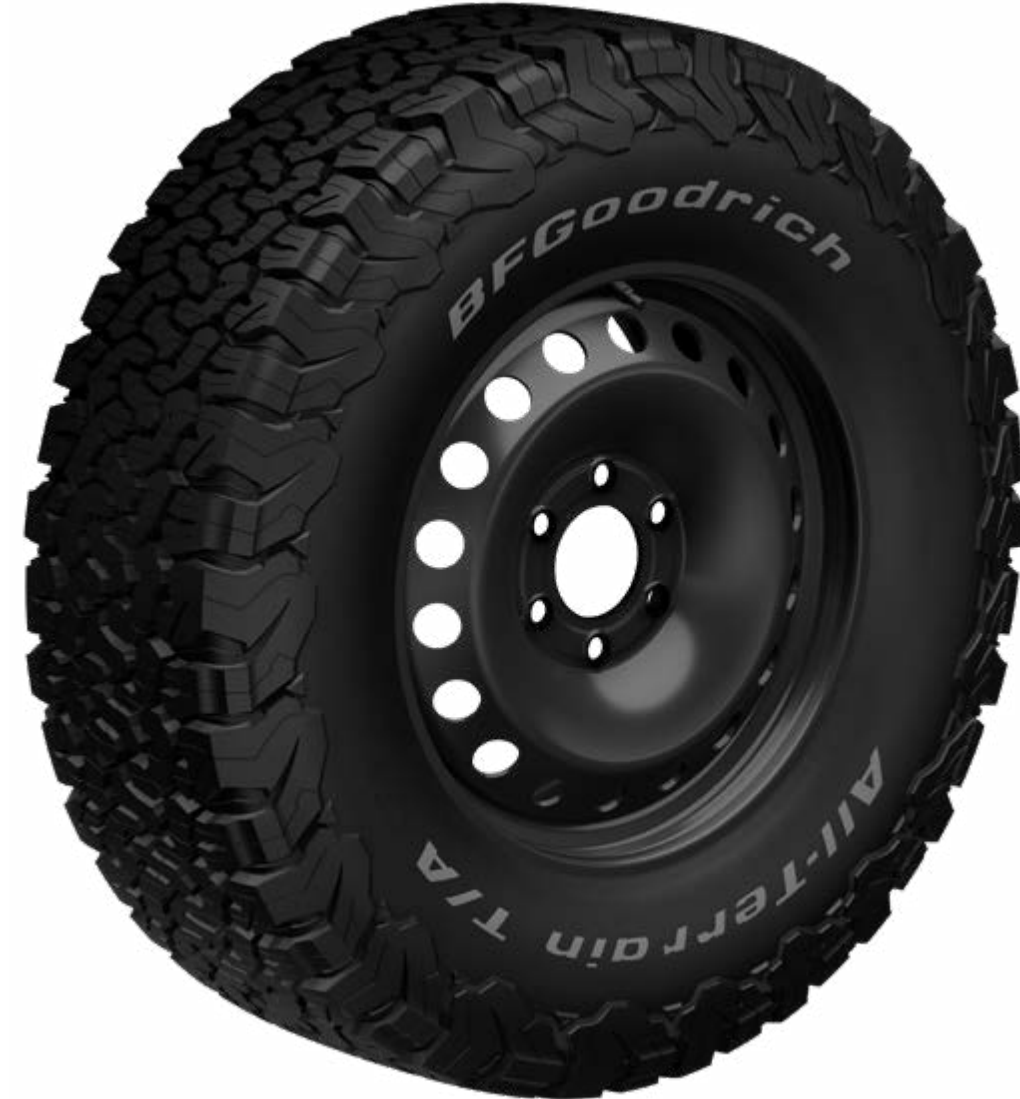
17" RIM - LT265/70R17 121/118S