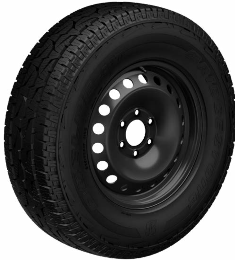
17" RIM - 265/70R17 XL 118S